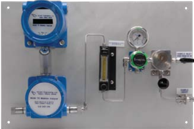
M70 with Signature Sample System