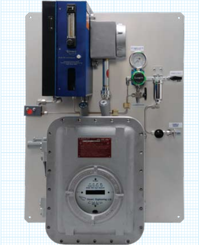
330 with Signature Sample System